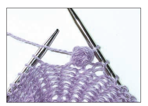
Step 6: As you finish each nupp, double-check it to make sure it is secure and that no loops have been missed.