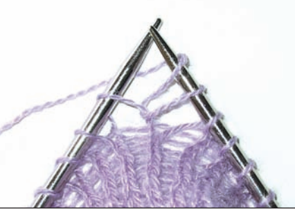
Step 2: Work a yarnover on the same needle. Notice how loose the stitches are.