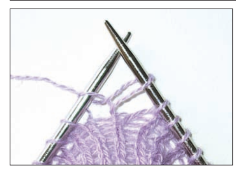
Step 1: Insert your needle as if to knit a stitch. Pull the stitch through but do not slide it off the needle.

www.fiddlesticksknitting.com dorothy@fiddlesticksknitting.com