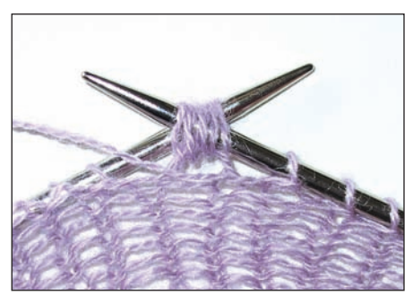
Step 5: Purl through all 7 stitches on the return row. Count each thread as you place it on the needle to make sure you have only the 7 stitches of the nupps.