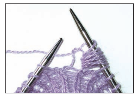
Step 3: Repeat the stitch and yarnover 2 more times, then work 1 last stitch without the yarnover and slide them all off the needle. There will be 7 extra stitches.